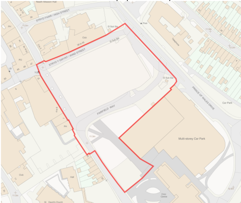
Plan 1: Location of proposed development