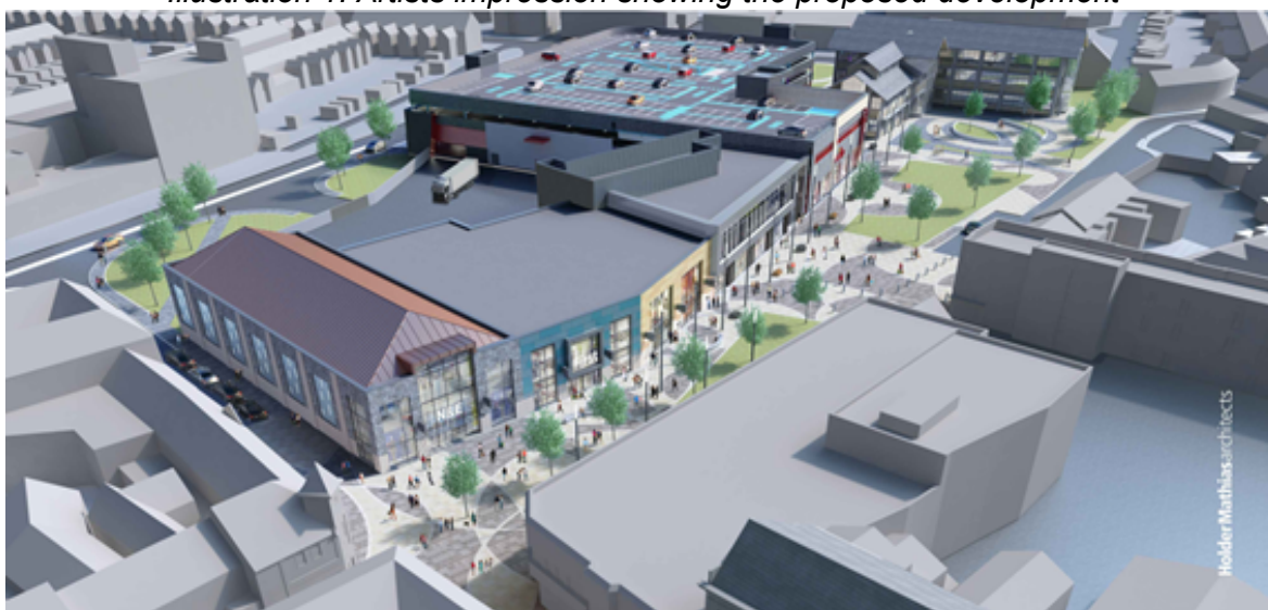
Illustration 1: Artists impression showing the proposed development

All plans / documents submitted in respect of this application can be viewed on the Council's online register .